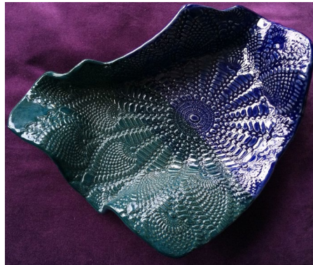
One of my favourite pieces to date

The pottery studio has become my happy place, where time stops and I am in total flow. Playing with clay, I get to express